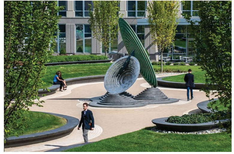
Sculpture for the Receptor project; credit: Cliff Garten Studio