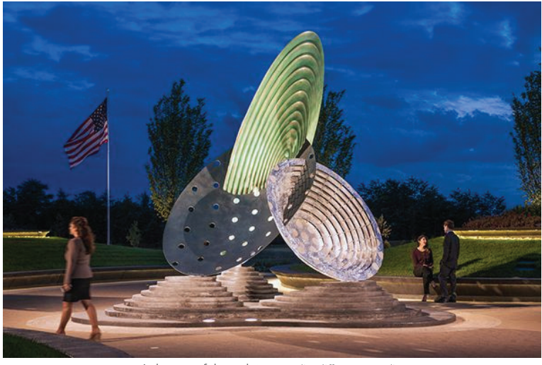
A close up of the sculpture; credit: Cliff Garten Studio

The whole area is well visible from the surrounding tall office buildings, including the adjacent National Geospatial Intelligence Agency. The employees and visitors use the space extensively - to rest, meet, and socialise. The central sculpture provides a great