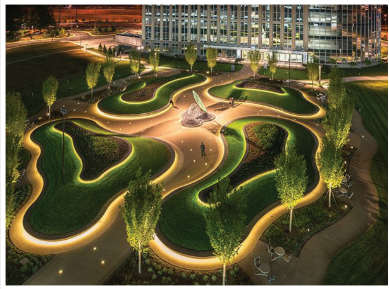
Lit up at night the Receptor project is certainly eye catching; credit: Cliff Garten Studio

Cliff Garten is a recipient of several rewards and fellowships, including being cited for design excellence by the American Society of Landscape Architects. His designs are defined by the fusion of sculpture and landscape architecture, integration of private and public function, personal and social experiences. The spaces designed in his studio are always site – specific, combining architecture, landscape and engineering and introducing art into people's everyday lives.