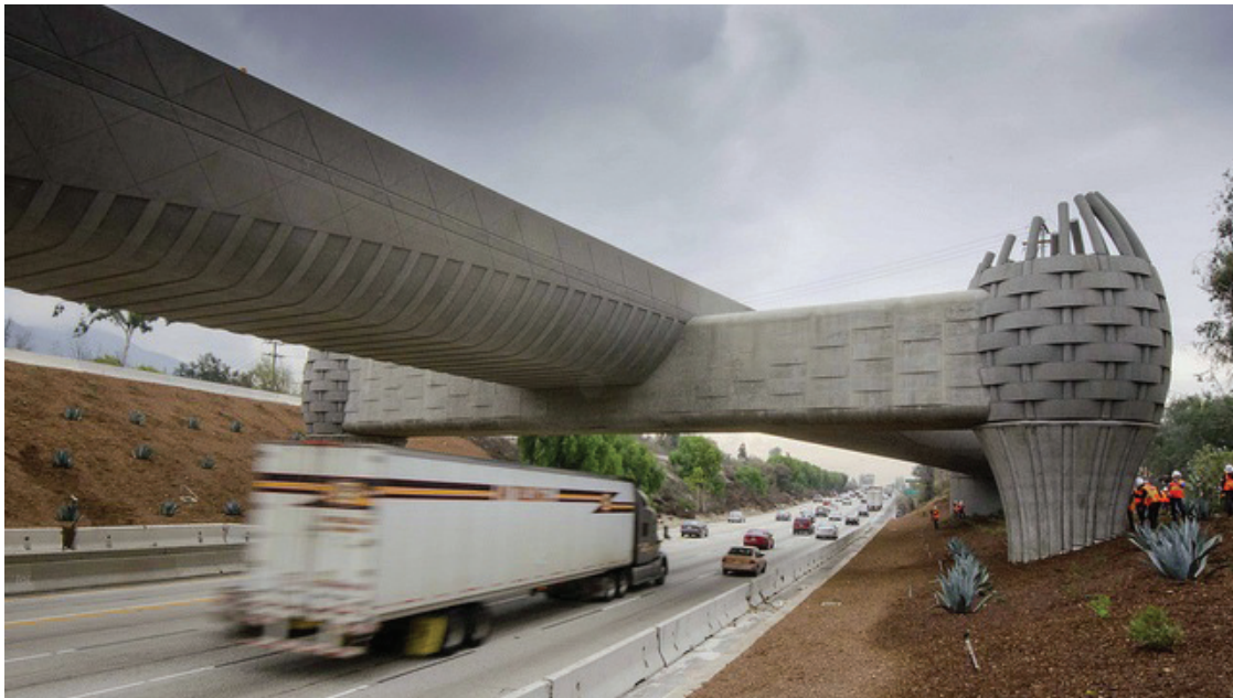
The Gold Line "basket bridge" on the 210 Freeway near Arcadia.

The gateway to Baldwin Hills Parklands also has a new bridge, with sculptural panels designed by artist Cliff Garten. The perforated pattern reinterprets the native landscape surrounding the bridge.