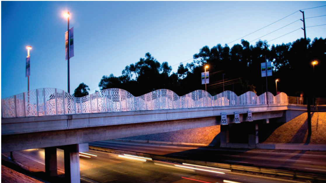
The new Cliff Garten-designed bridge at Baldwin Hills Parklands.

Politicians and designers alike hope these bridges will be more than simple passage from one location to another; that these bridges will help propel Los Angeles infrastructure to a future that embraces bicyclists, walkers, and transit riders, and does so with style. "They're not just concrete slabs. They can and should be amenities to the community - economic, physical and aesthetic," argues Maltzan. "Good design happens because there are people invested in the design."