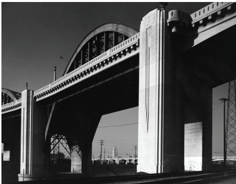
Sixth Street Bridge.