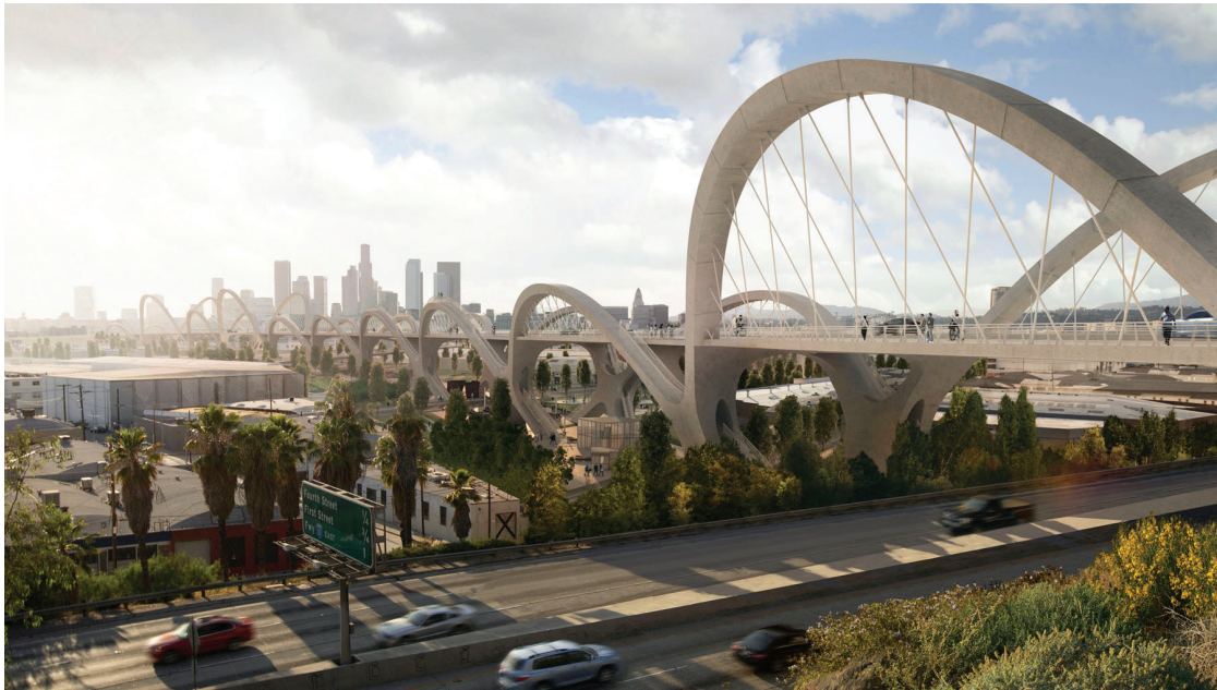
Rendering of the future Sixth Street Bridge