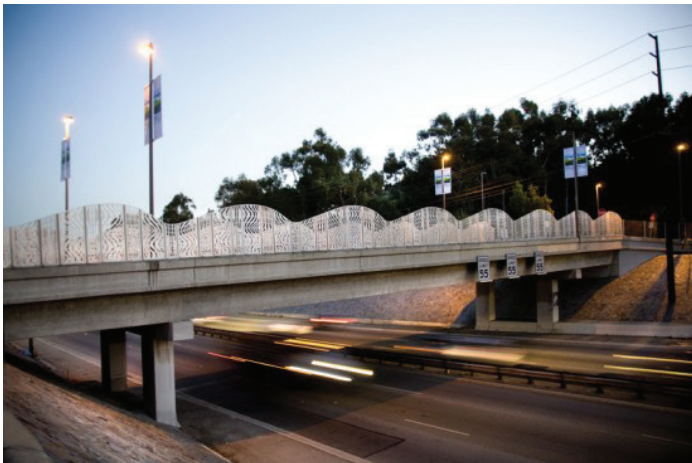
(Berg & Associates)